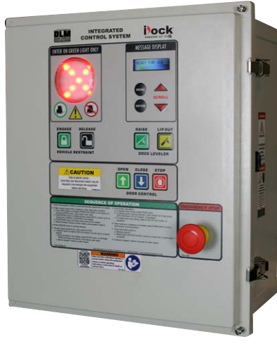
Upgrade to iDock Controls with optional integrated equipment for a more efficient loading dock.

image caution signs notify the truck driver.