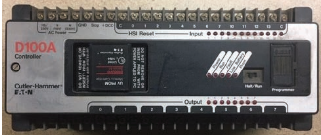
Unsupported Cutler-Hammer D100A

These include, <u>but are not limited to</u>, the below PLCs manufactured by Cutler-Hammer, IDEC, Allen-Bradley and General Electric. Any PLCs not listed on page 1-2 of this document are typically unsupported; contact Technical Services for assistance with a PLC if support status is unknown.