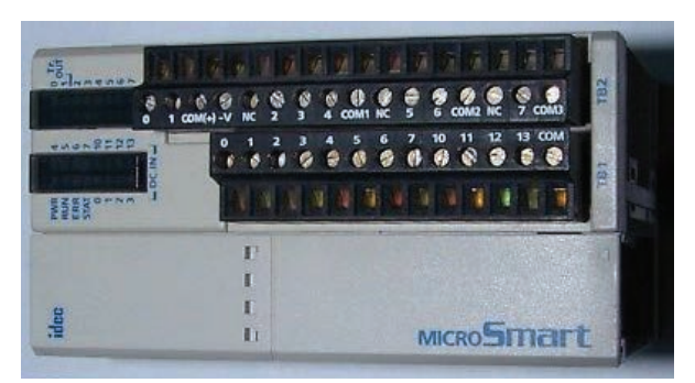
Unsupported IDEC FC20A