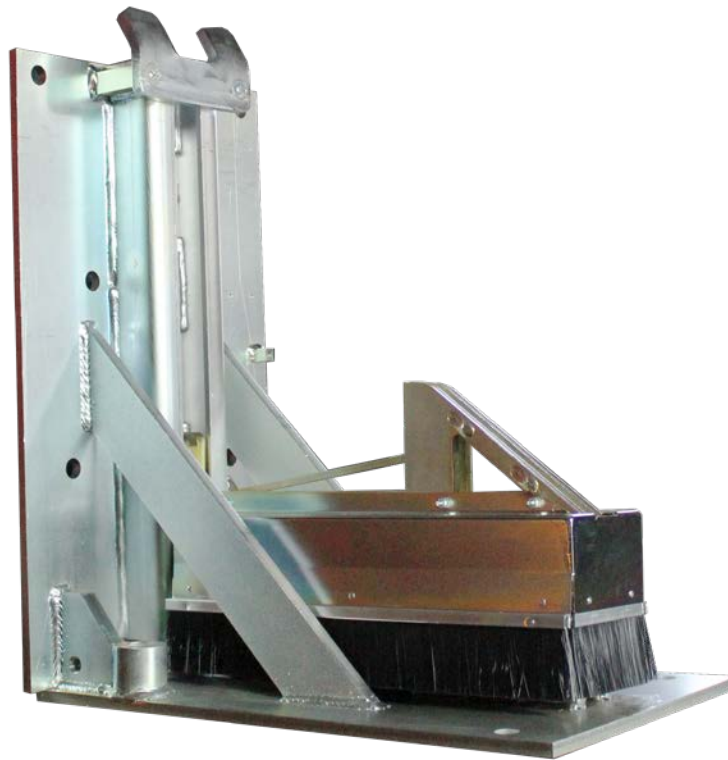
* Automatic PowerStop shown with advanced communication controls.