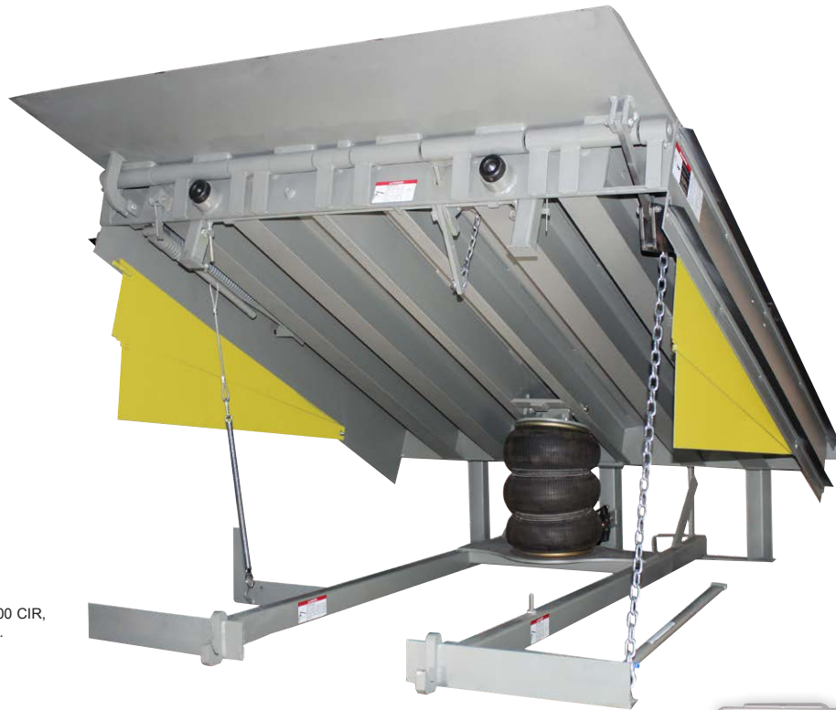
CentraAir Series, 6' x 8', 45,000 CIR, Full Range Toe Guards.