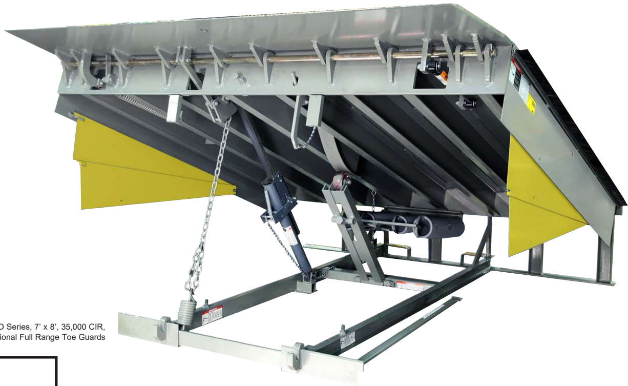
LMD Series, 7' x 8', 35,000 CIR, Optional Full Range Toe Guards