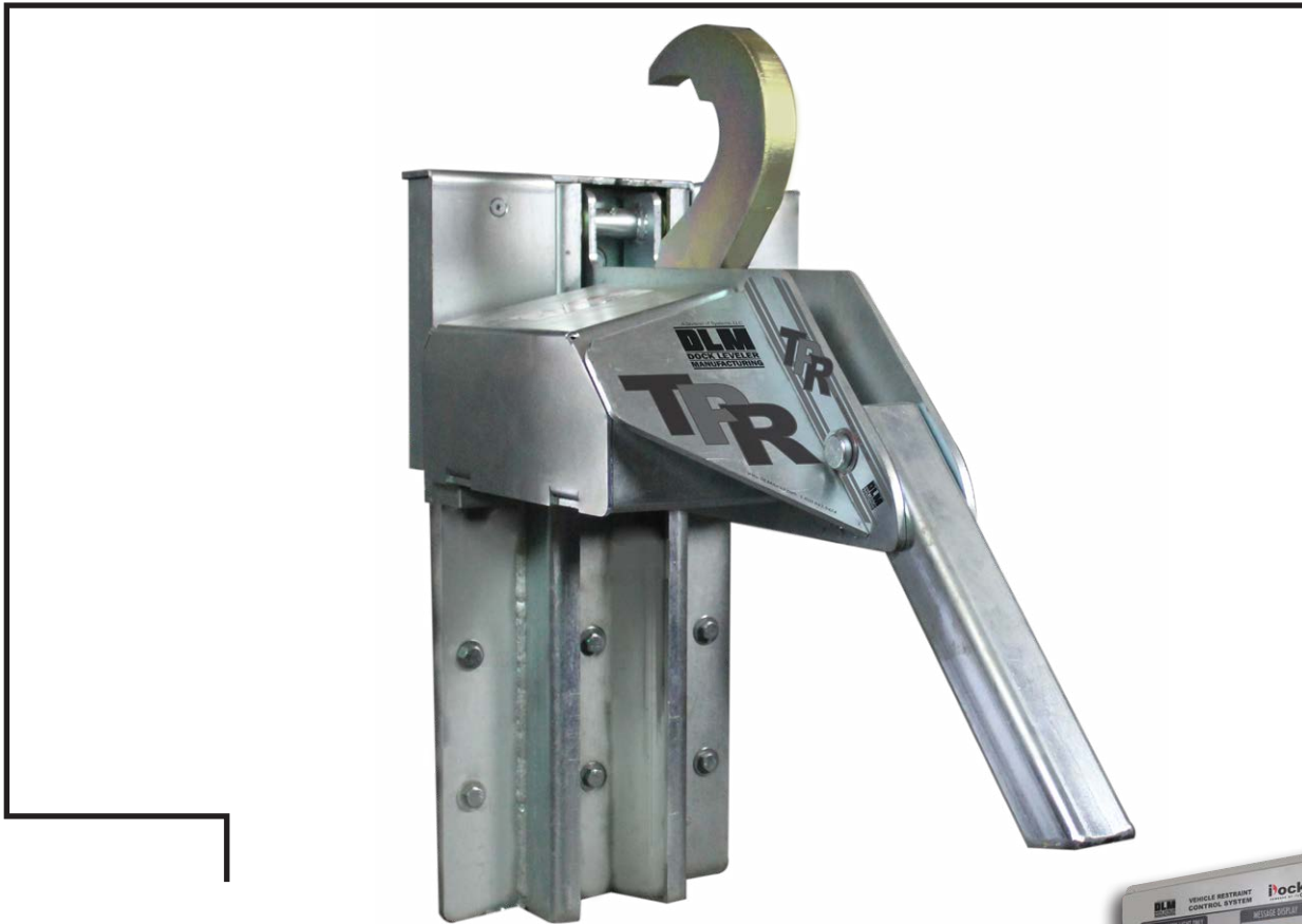
* TPR® shown with advanced communication controls.