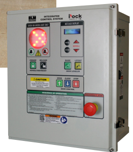
Integrated Control Panel Shown (Size varies with options)