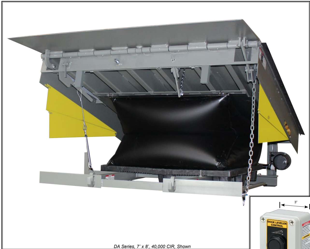
DA Series, 7' x 8', 40,000 CIR, Shown