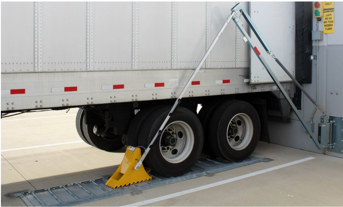
*UXL sample installation shown with optional snow removal ground plate. iDock Controls shown with optional dock light push button. Product subject to change.