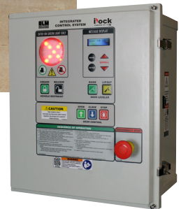
Integrated Control Panel Shown (Size varies with options)