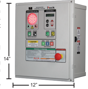
Integrated Control Panel Shown (Standard Size)

WARRANTY: iDock Controls feature a full one (1) year base warranty on all structural, mechanical and electrical parts, including freight and labor charges in accordance with Systems, LLC's Standard Warranty Policy. Systems, LLC warrants all components to be free of defects in materials and workmanship, under normal use, during the warranty period. This base warranty period begins upon the completion of installation or the sixtieth (60th) day after shipment, whichever is earlier.