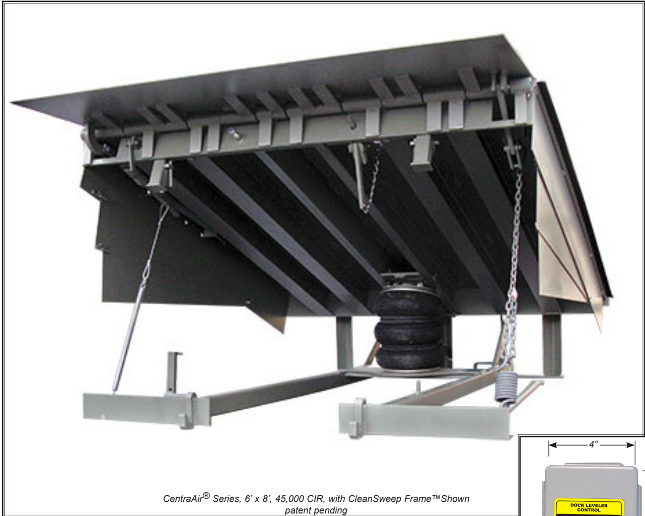
CentraAir® Series, 6' x 8', 45,000 CIR, with CleanSweep Frame™ Shown patent pending