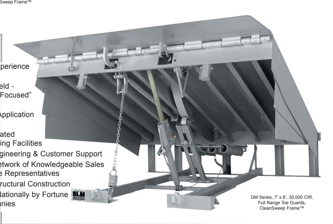
DM Series, 7' x 8', 30,000 CIR, Full Range Toe Guards, CleanSweep Frame™