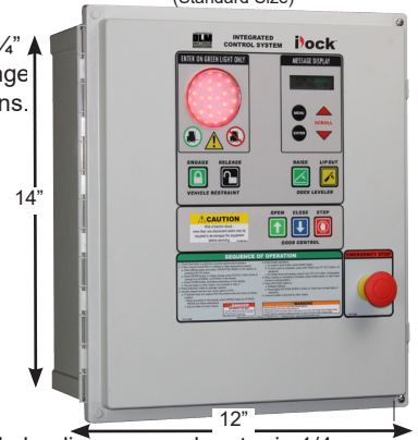
Integrated Control Panel Shown (Standard Size)

WARRANTY: All PowerStop® vehicle restraints feature a full one (1) year base warranty on all structural, hydraulic and electrical parts, including freight and labor charges in accordance with Systems, LLC's Standard Warranty Policy. Systems, LLC warrants all components to be free of defects in materials and workmanship, under normal use, during the warranty period. This base warranty period begins upon the completion of installation or the sixtieth (60th) day after shipment, whichever is earlier.